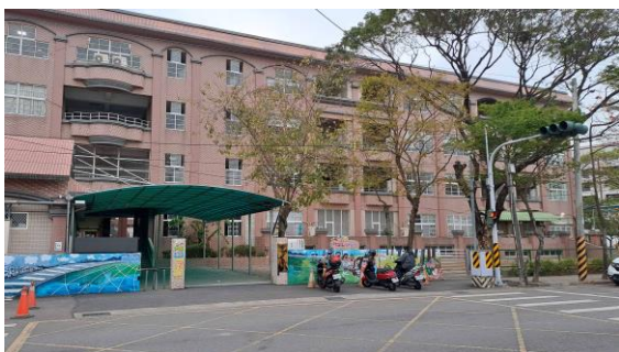
Fig. 7. Cultural and educational buildings in Yingpan-Hou district (Cont.) [3]