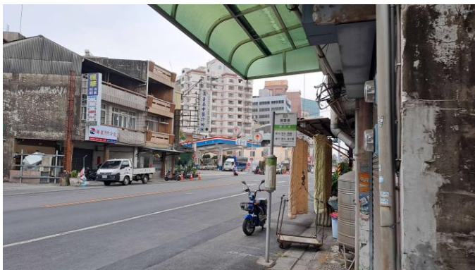
Fig. 3. Bus stop of Hsing-nan Bus and Tainan Bus at Yingpan-Hou area