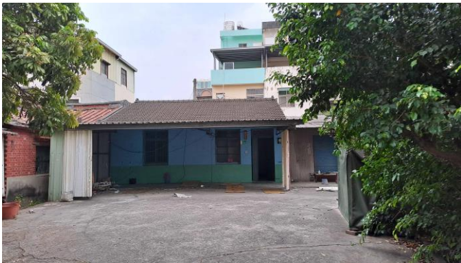
Fig. 13. The demolition and relocation of the three-section compound next to Chung-shan Road is underway (Cont.) [3]