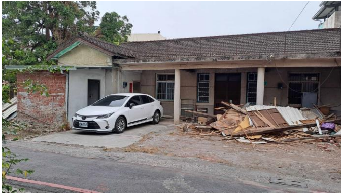
Fig. 12. The demolition and relocation of the three-section compound next to Chung-shan Road is underway [3]