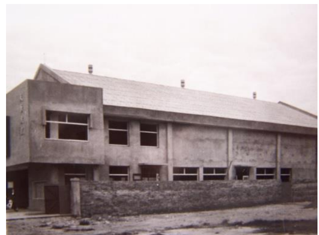
Fig. 2. Side view of Tian-Hsin Cinema when it was completed. (Cont.)

As shown in Figs. 1 and 2, Tian-hsin cinema was the third cinema to appear on the streets of Hsin-hua Town, after Hsin-