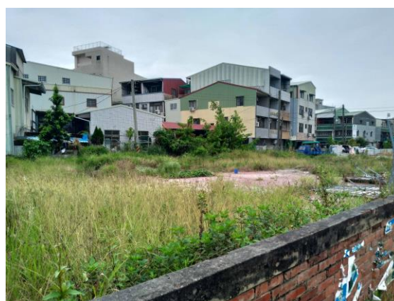
Fig. 11. The National Army left the camp land unused, creating a dead zone of security in Yingpan-Hou District [3]

The Siraya were forced out by the Han Chinese and moved to the eastern mountains, mostly settling in Zuozhen and Ganglin. However, there are still descendants in the area of Hsin-he-zhuang and Kou-pi, Zhiyi-li, Hsin-hua. After all, we are all descendants of those who were instrumental in the development of the Tavocan region.