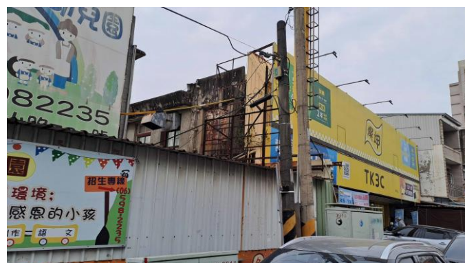
Fig. 5. Side view of the building of Tian-hsin Cinema [3]