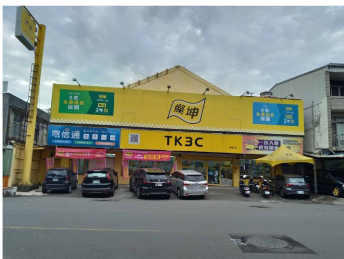
Fig. 4. The building at the back of the mall is the former site of the Tian-hsin Cinema [3]