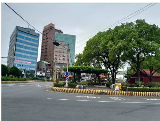
Fig. 8. Circular ring of the Yingpan-Hou district [3]