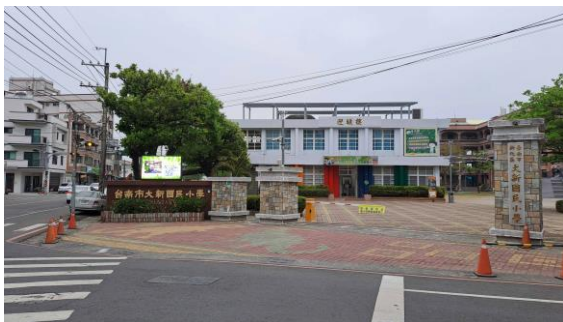
Fig. 6. Cultural and educational buildings in Yingpan-Hou district [3]