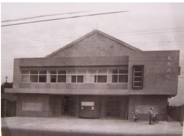
Fig. 1. Side view of Tian-Hsin Cinema when it was completed.

hua Cinema and Hsin-guang Cinema. It represents the more recent development of the town of Hsin-hua and has a special contemporary significance. Since the theater is located at the roadside of Hsin-hua Town to Tainan City, the business was once quite good. Even after the closure of the Hsin-hua cinema in 1973, together with the Hsin-guang Cinema, it contributed to the development of the commercial district of Hsin-hua Town, which was quite helpful to the economic development of Hsin-hua.