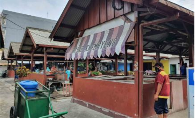
Fig. 4. A photo of building and atmosphere of Krempyeng Market.

4. One particular infrastructure in the Kayutangan heritage village is the market