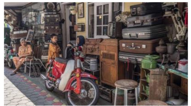
Fig. 1. A photo of the Mr. Link's house and its surroundings.

This house is a place for collecting, buying, and selling antiques such as various old cameras, photo collections where in some occassions also holding event of photography workshops. Within this house, visitors can also see several collections of motorbikes and antique interior furniture. Thefore, for this particular reason, if visitors do not compelled to buy antiques, they can still use these various collections as backgrounds and complementary setting for their selfie photos.