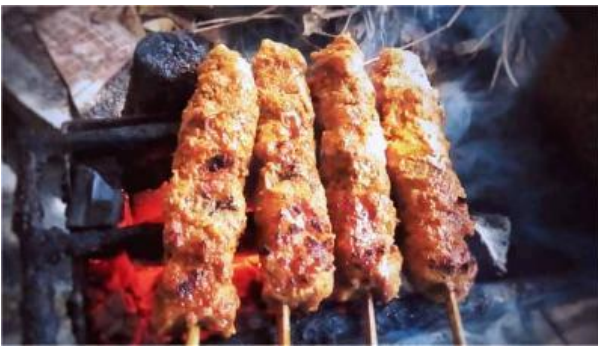
Fig. 2. A photo of Sate Gebug (a beef meat satay).

2. The distinctive Kayutangan cuisine at Warung Kuning Bu Nap (Mrs. Nap Yellow Stall)