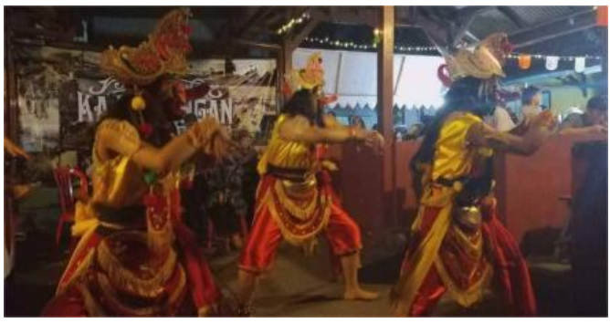
Fig. 3. Photos of mask dance in the athmosphere of Topeng Malangan Dance performance.

Wisata /POKDARWIS (Tourism Awareness Group), the Malangan Mask dancer is often called to perform in the Kayutangan heritage village on certain occasions. This is an effort to add attractiveness side for tourists who visit this area by raising the typical Malangan culture.