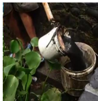
Figure 2. Blackwater

activities carried out in the field, namely the Communal wastewater plant of Tlogomas Malang (IPAL Komunal Tlogomas, Kota Malang).