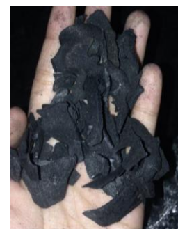
Figure 3. Coconut shell charcoal

The variables observed are discharge variation and the residence time as an independent variable, as well as the level of turbidity as the dependent variable. The method of data analysis is Regression with linear and exponential equations processed on the SPSS 21 program. The design of the filter plant was made on a laboratory scale by constructing a filter box measuring of 25 x 60 cm. In addition to the filter box, the equipments used in this study include wiremesh 18, frame and turbidity meter. The materials used include blackwater as research sample, and coconut shell charcoal as the filter material. Coconut shell charcoal filter was made with a thickness of 30 cm. This thickness was determined in the previous research.