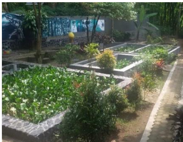
Figure 1. The condition in IPAL Komunal Tlogomas

deposition of organic compounds in waste without any treatment. However, sedimentation processing is not efficient to use, because the process is slow, especially if the waste is in sufficiently large quantities even though the cost is relatively cheap. Filtration is a solid-liquid separation process through a filter (filter). Filtration is one form to produce high-efficiency waste solids. When compared with the processing of sedimentation, filtration requires a relatively expensive cost, besides that the effectiveness of the membrane rapidly decreases because the pores are likely to be covered by organic particulates.