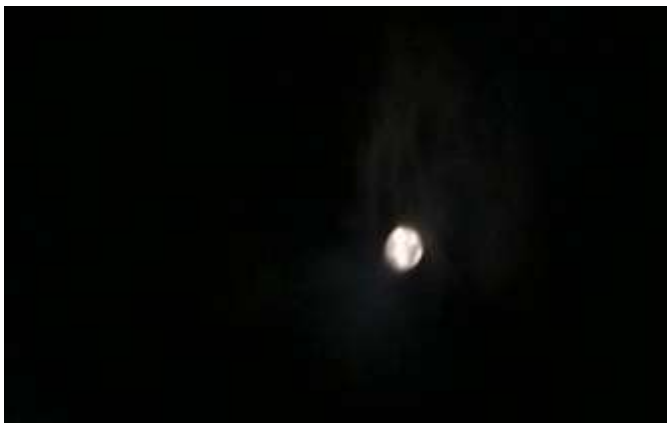
Fig. The MOON in night on 26 august 2018 from Rajasthan India.

organism is of many colors, with the proof that whenever the Sun has come to earth, it will also be true that the Earth can go from the Earth with ease while going on Mars Time will take longer, so life should be saved on the first moon.